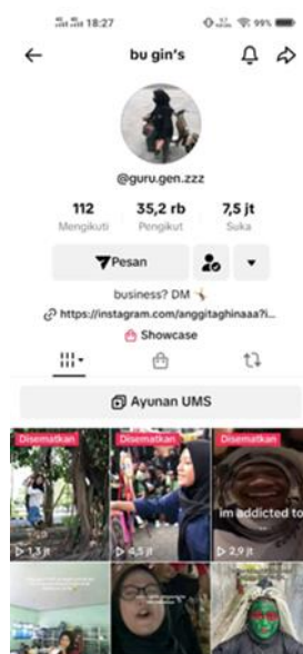
Figure 1 Profile of the TikTok account @Bu Gin's with its more than thirty five thousand followers (35,2 ribu pengikut)

Nowadays, media for conveying information, communicating and discussing are easy to find and use by all levels of society. One of the social media that is often used by people is Tiktok. Tiktok is a new social media that provides a platform for its users to express their talents through video content. TikTok turns users' phones into mobile studios. One of the contents that many people are interested in on Tiktok social media is humor videos. Humor videos contain content that contains funny things. In the midst of the popularity of humorous videos on TikTok, violations of the principle of cooperation can be found in every conversation.